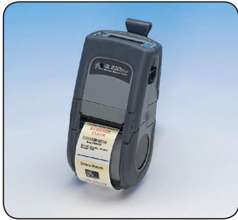
QL 220 Plus™

Take 2-inch label, ticket, and receipt printing where stationary and larger mobile printers dare not go—whether it's down store aisles, on hospital rounds, or onto retail pharmacy counters. Strap or clip on the sleek, 1.04-pound QL 220 Plus network-addressable label/receipt mobile printer and move with ease!