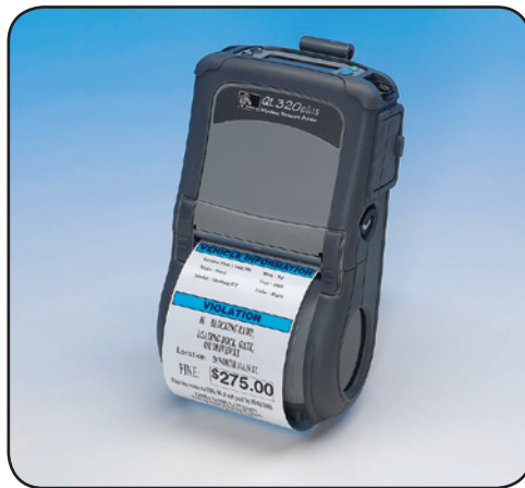
QL 320 Plus™

Zebra's popular QL 320 Plus mobile printer, for print widths up to 3 inches, was the first to offer the flexibility of 802.11b/g radio modules to meet evolving needs and wireless standards. Count on its durable design to endure tough manufacturing or shipping/receiving environments.